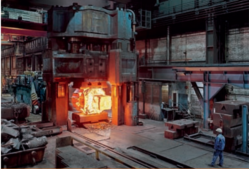
Forging on the 55 MN open-die forging press