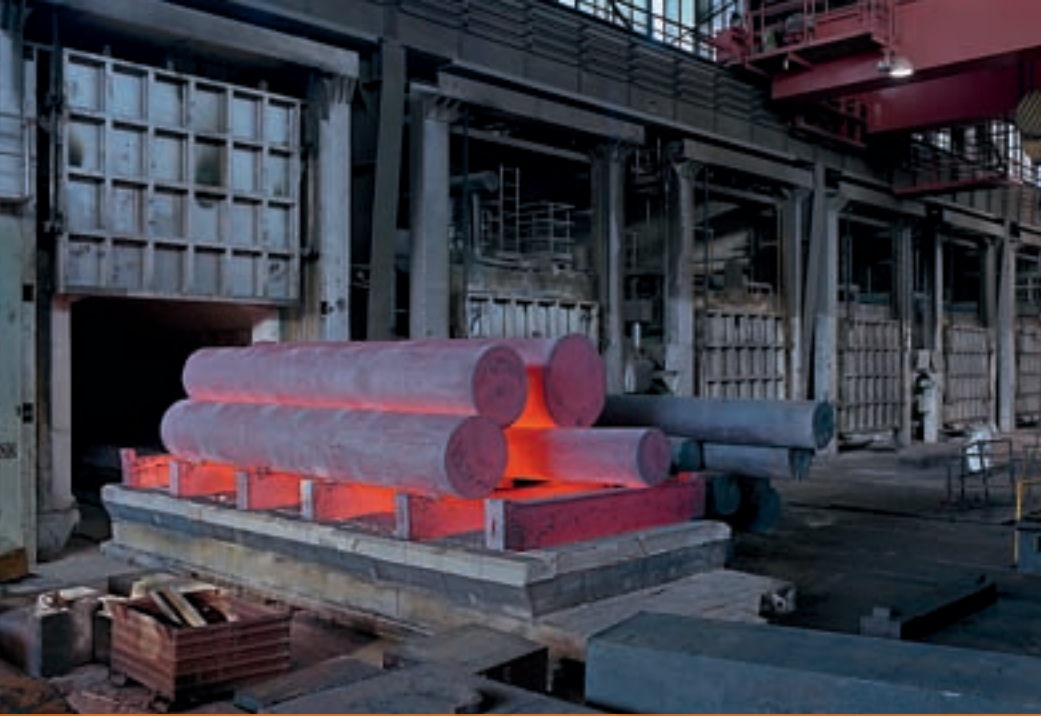
Tool steel undergoing heat treatment in the annealing shop