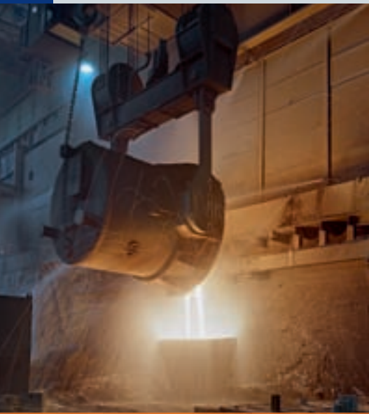
Discharging the residual steel